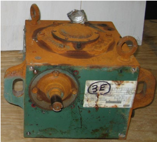
70 Series Gearbox returned to SPX

SPX FLOW Lightnin is the only supplier of original equipment for Gearbox Exchange Services for industrial mixers and agitators. Exchange services allow the customer to get a direct replacement gearbox for a fraction of the cost of a new one. Lightnin's 48-hour "Break-down" delivery limits your scheduled down time, thus reducing your production losses to a minimum. Lightnin's exchanges are held to original manufactured standards and include the same warranty as new equipment.