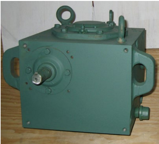
70 Series Gearbox exchange returned to client