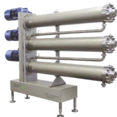
GS pin rotor machine

HPP → first chiller with intermediate crystalliser → second chiller → third chiller → pin rotor machine (volume 2 liters) → filling machine. The emulsion is transferred through the HPP with a capacity of 90 kg/hour to the first cooling section of the SSHE, the GS Perfector. Here sub cooling of the emulsion, nucleation and subsequently crystal growth takes place. Before entering the second cooling section the semi crystallized emulsion is kneaded in the intermediate crystalliser mounted directly on the shaft on the first cooling tube. Intermediate crystalliser is employed in order to yield mechanical work to the product and hereby ensure homogeneity, plasticity and spreadability. After the second and the third cooling tube the crystallized fat is finally kneaded in the GS pin rotor machine before filling.