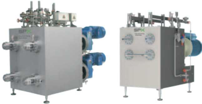
Examples of SSHE units for fat crystallization from the GS brand: GS Nexus and GS Perfector

microns, for the samples produced with less intensive chilling when compared to sizes of around 6.4 microns for samples produced with more intensive chilling in the first cooling section of the GS Perfector.