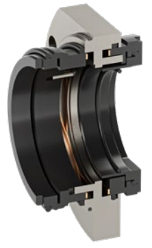
Double Mechanical Seal

Abbreviation Key: SM Single Mechanical DM Double Mechanical C Carbon SC Silicon Carbide TC Tungsten Carbide NF Narrow Face Inner = Product Side, Outer = Flush Side