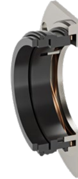
Single Mechanical Seal