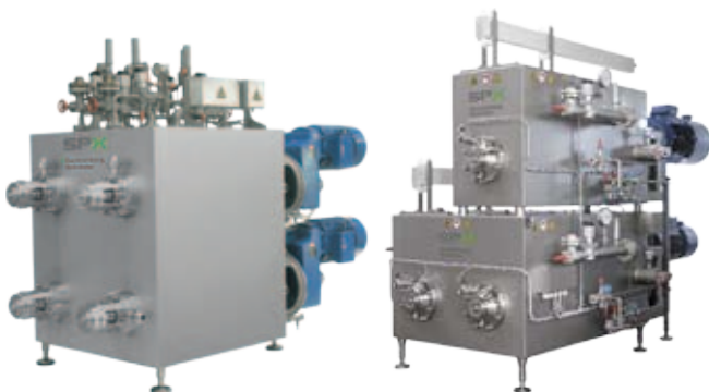
SSHE units from the GS brand: GS Nexus and GS Kombinator.

The heart of the crystallization line is the high pressure SSHE, the GS Nexus, the GS Kombinator or the GS Perfector, in