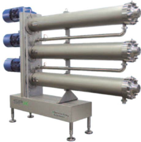
GS pin rotor machine

plastic structure. If the product is meant to be distributed as a wrapped product it will enter the GS Nexus, GS Kombinator or GS Perfector again before it settles in the resting tube prior to wrapping. If the product is filled into cups, no resting tube is included in the crystallization line.