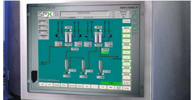
GS Logic control system

the margarine processing line from recipe information to final product evaluation. The data logging includes the capacity and output of the high pressure pump (l/hour and back pressure), product temperatures (incl. pasteurization process) during crystallization, cooling temperatures (or cooling media pressures) of the SSHE, speed of the SSHE and the pin rotor machines as well as load of motors running the high pressure pump, the SSHE and the pin rotor machines.