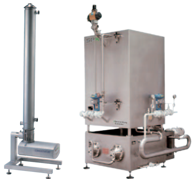
GS Consistator ® as low pressure SSHE or Kombinator 250 SHCW as high pressure SSHE for pasteurization

From the buffer tank the emulsion is normally continuously pumped through either a plate heat exchanger (PHE) or a low pressure scraped surface heat exchanger (SSHE), the GS Consistator ® , or high pressure SSHE, the GS Kombinator or GS Perfector, for pasteurization prior to entering the crystallization line.