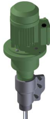
Bung Adaptor Assembly with Shaft