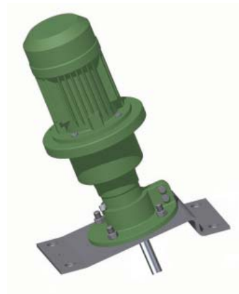
Angle Riser Assembly with Shaft