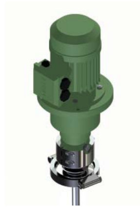
Sanitary Flange Lip Seal Assembly with Shaft