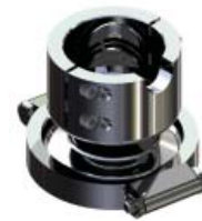
Flange Lip Seal