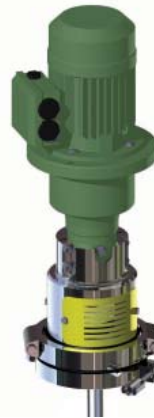
Sanitary Flange Mechanical Seal Assembly with Shaft