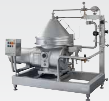
Biotech - Clarifier for lactic acid bacteria recovery