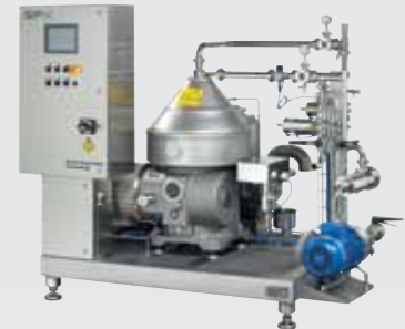
Alcoholic beverage - Juice wine and sparkling wine clarifier