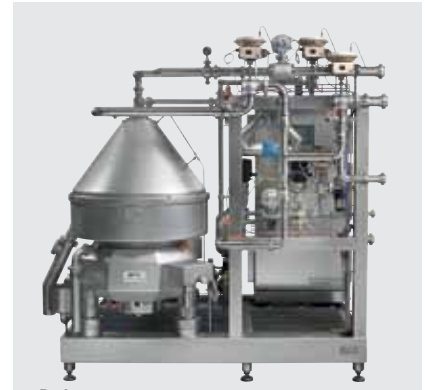
Dairy - Milk Separator with automatic milk and cream standardization system