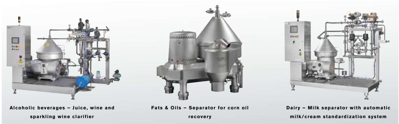
Alcoholic beverages – Juice, wine and sparkling wine clarifier

Mechanical separation and clarification of liquids requires efficient and effective removal of suspended solids of various types and sizes combined with gentle treatment to preserve the quality of the end product. The most widely used method is centrifugation using a vertical disk stack – a technology that presents significant challenges in disk stack design in order to optimize separation with minimum product impact, while ensuring energy efficiency, operational reliability and a high level of safety.