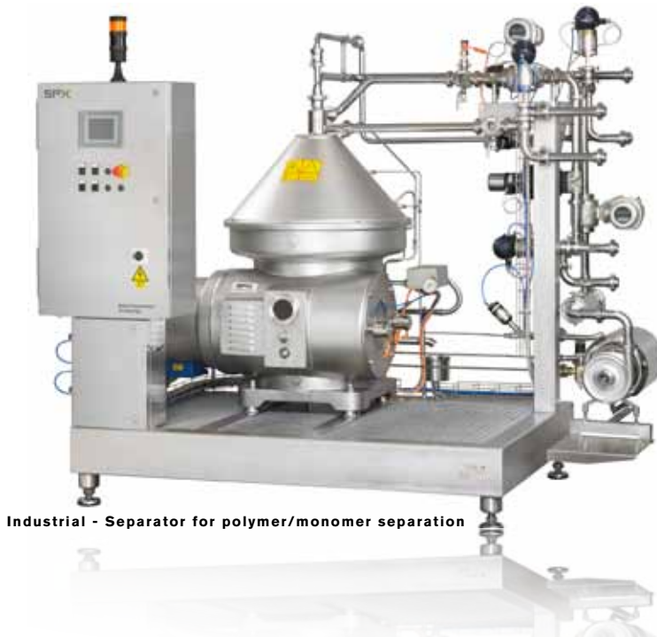
Industrial - Separator for polymer/monomer separation

We also offer a wide range of separation process accessories enabling you to meet your separation and clarification needs from a single supplier.