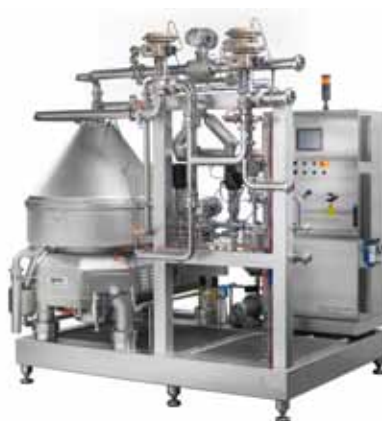
Dairy - Milk separator with automatic milk and cream standardization system